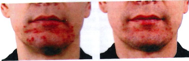
FIGURE 3. A 19-year-old male before (left) and after 12 treatments (right) with the 650-microsecond laser at 2-week intervals.