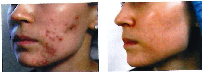
FIGURE 5. A 25-year-old female before (left) and after 12 treatments (right) with the 650-microsecond laser at 2-week intervals.