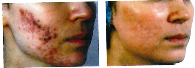
FIGURE 4. A 25-year-old female before (left) and after 12 treatments (right) with the 650-microsecond laser at 2-week intervals.