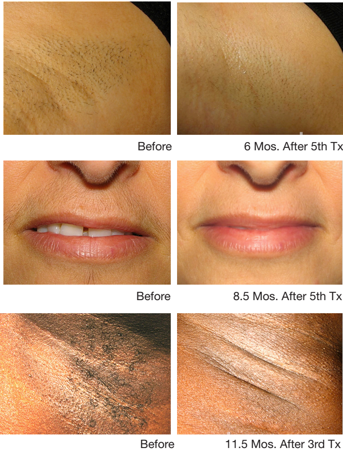
Figure 2. Clinical Case Examples: Long Term Hair Removal Using LightPod Neo 650 microsecond Pulsed 1064nm Laser